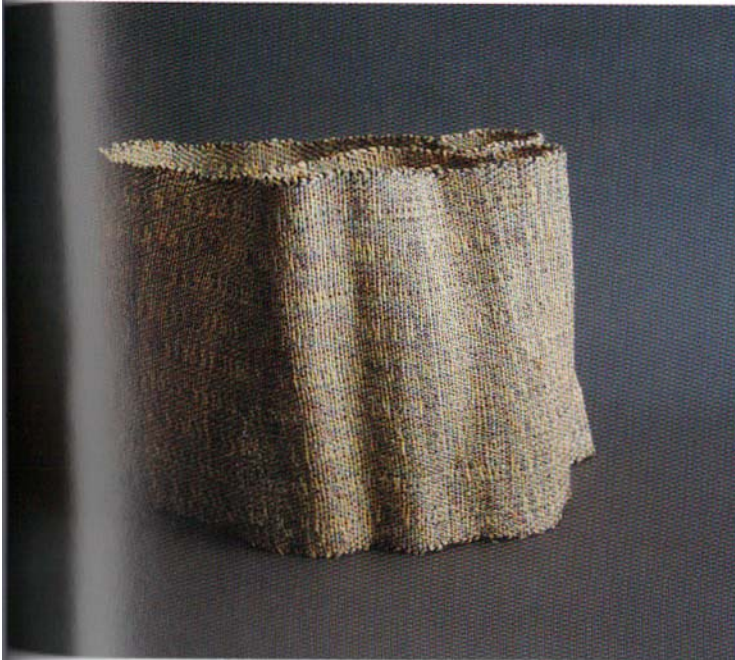
0313 | Natalie Boyett, USA