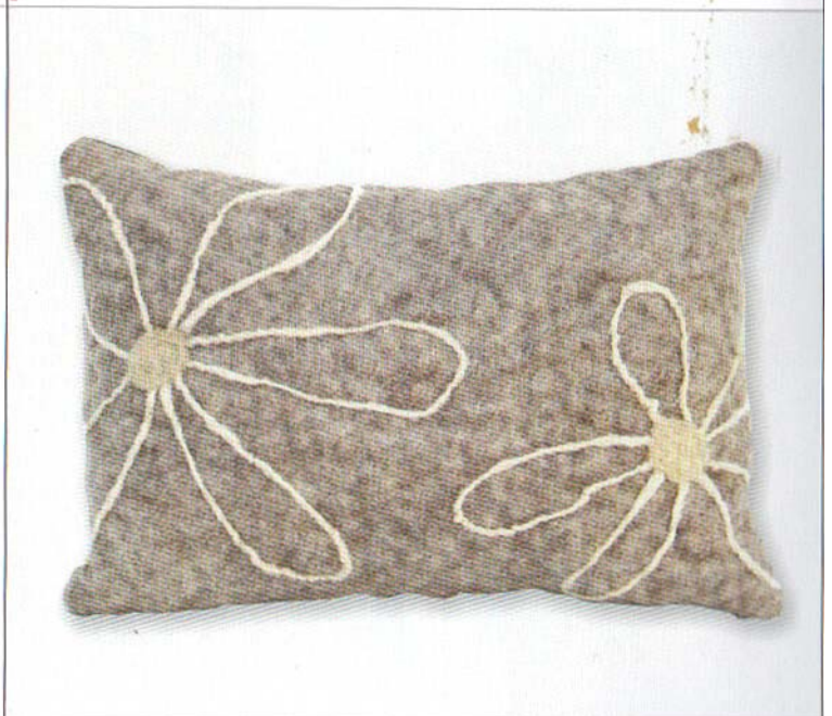
0314 | Felted Style, USA