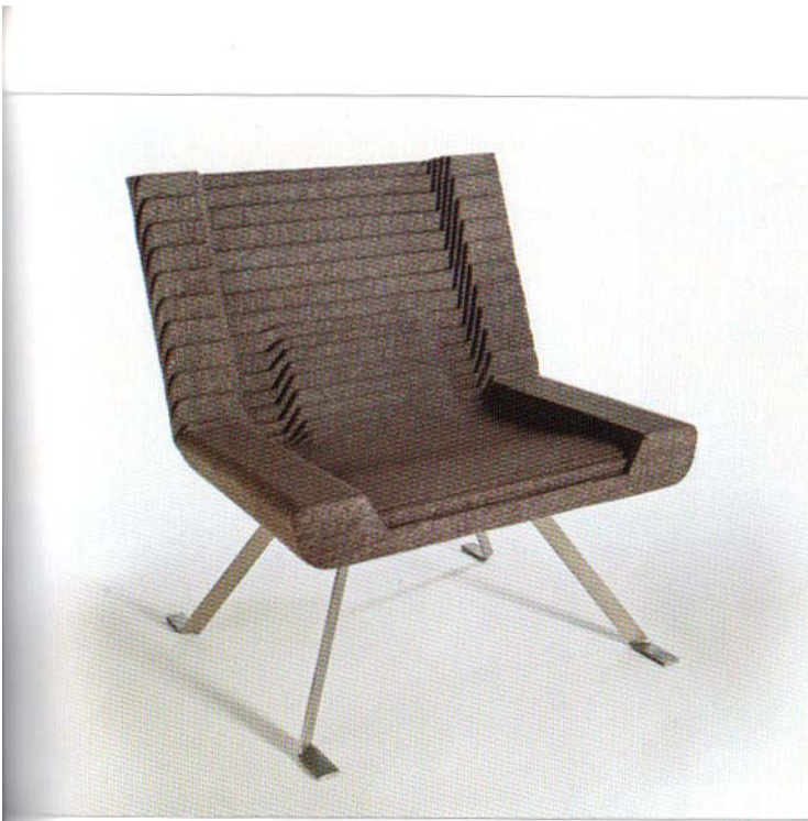
0311 | Ben K. Mickus, USA